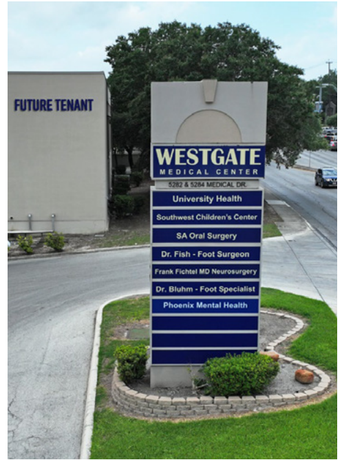
Building signage opportunity with high visibility from Medical Dr. with full second floor lease.