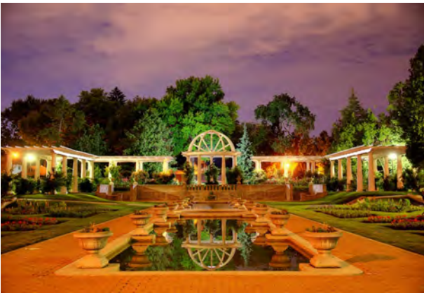
Lakeside Park Rose Garden

• Indiana ranks 9th in the 2023 US tax index in the United States. (2023 Tax Foundation stats)