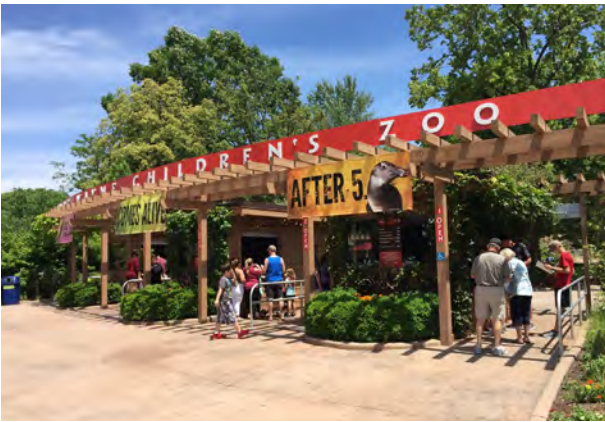
Fort Wayne Children's Zoo