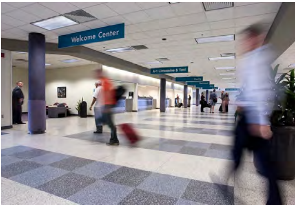
Fort Wayne International Airport