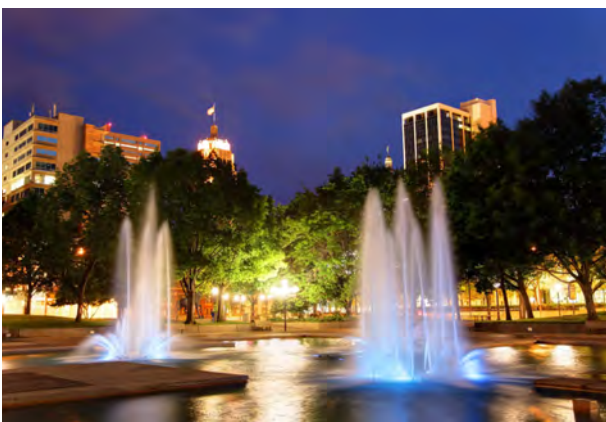
Downtown Fort Wayne

• Fort Wayne International Airport (FWA) is home to four major carriers: Delta, United, American and Allegiant Air. There are weekly non-stop departures to Orlando, Tampa, Atlanta, Dallas, Sarasota, Las Vegas (seasonal), Philadelphia, Myrtle Beach (seasonal), Chicago, Detroit, Phoenix, Minneapolis, Fort Meyers and Charlotte.