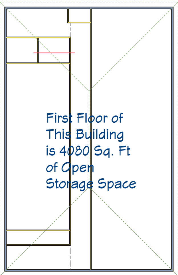
OFFICE Bldg - 1ST FLOOR-SECT 2 #310 4080 SQ. FT.