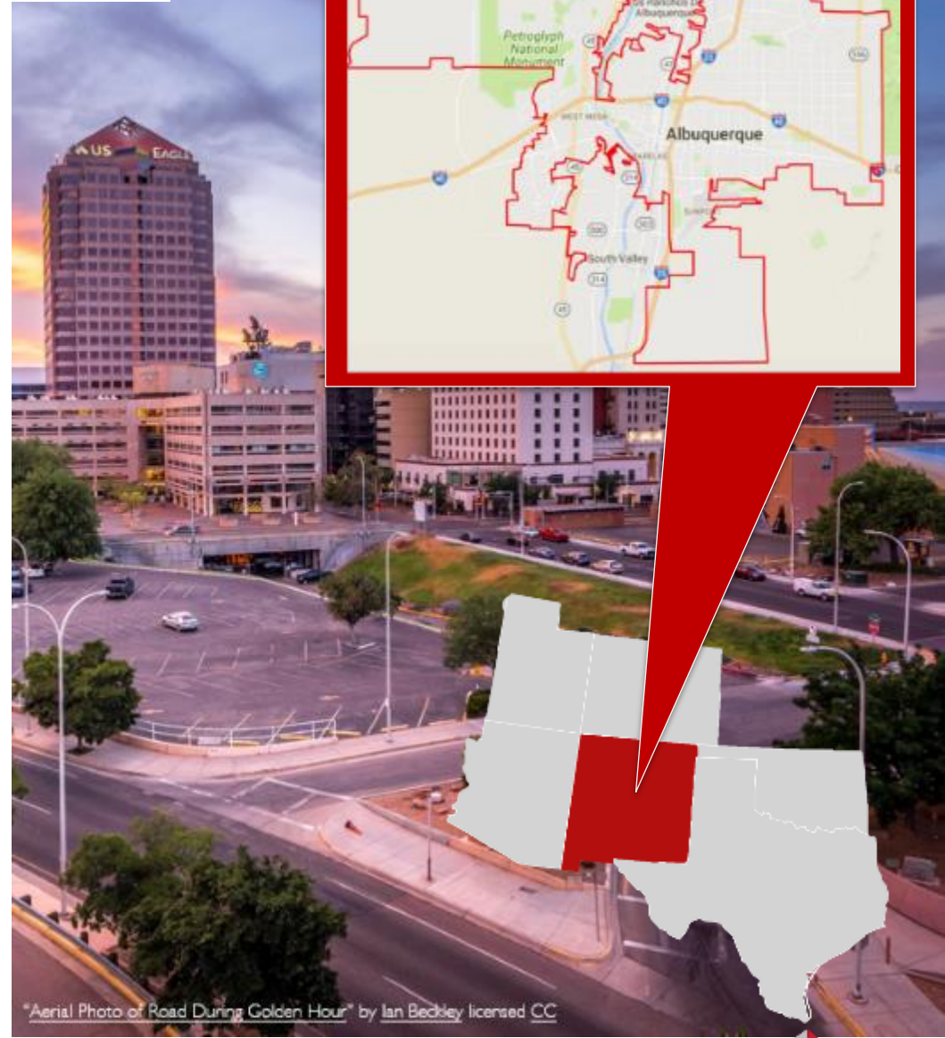
"Aerial Photo of Road During Golden Hour"

FOR SALE / 4201 WYOMING BLVD NE, ALBUQUERQUE, NM 87109