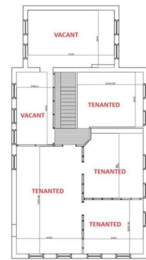
PLEASE NOTE PLAN IS NOT TO SCALE AND IS FOR IDENTIFICATION PURPOSES ONLY