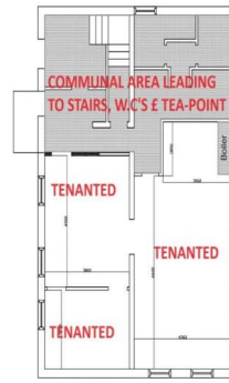
PLEASE NOTE PLAN IS NOT TO SCALE AND IS FOR IDENTIFICATION PURPOSES ONLY