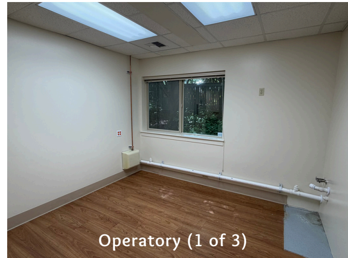
Operatory (1 of 3)