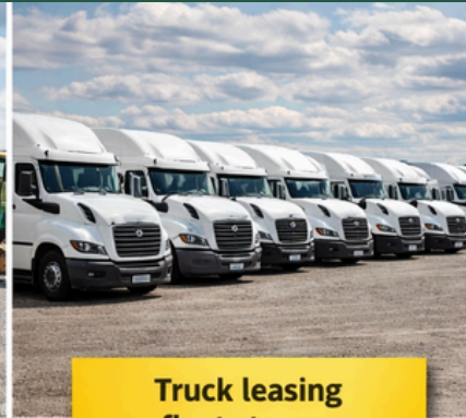
Truck leasing fleet storage