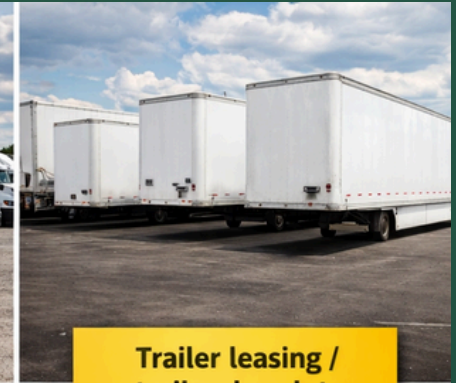
Trailer leasing / trailer drop lots