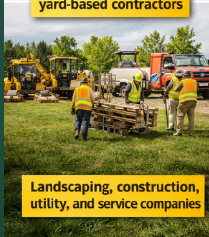
Landscaping, construction, utility, and service companies