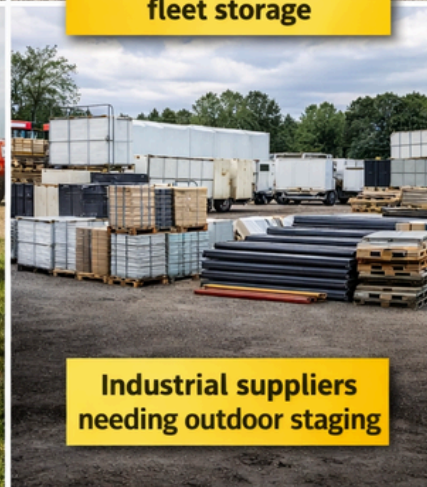
Industrial suppliers needing outdoor staging