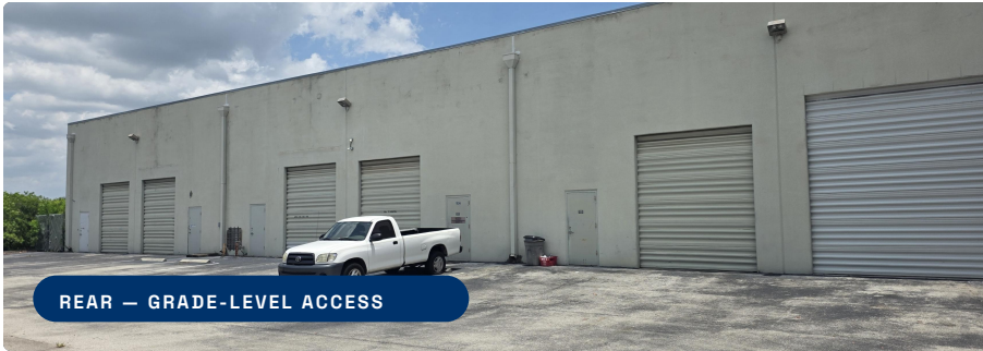
REAR — GRADE-LEVEL ACCESS