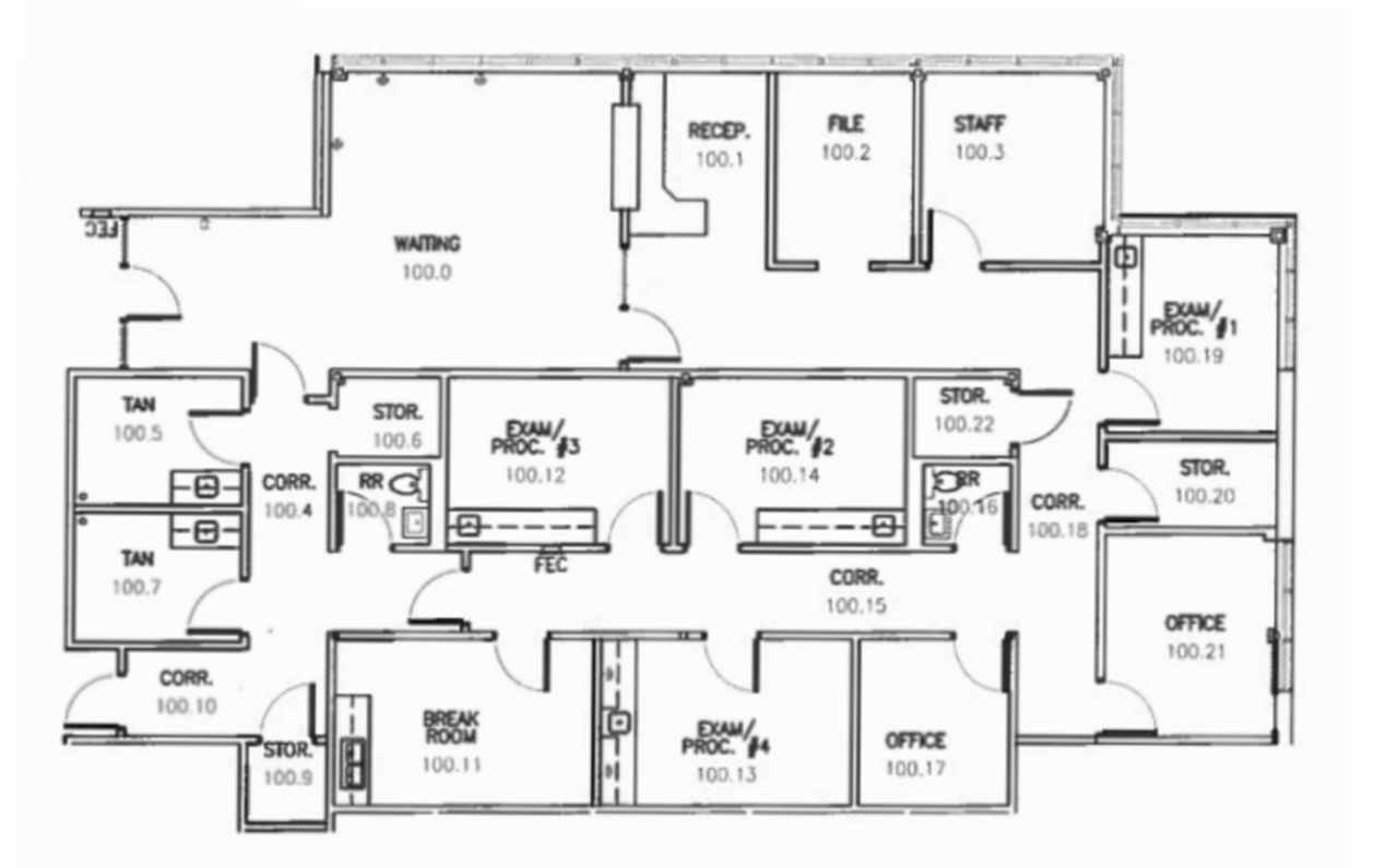
SUITE 100: 2,942 SF