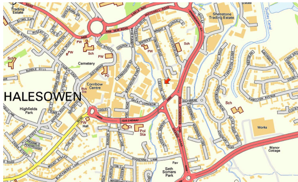
Licence Number - 100022432 - Not to Scale

Strictly by prior arrangement with the agent.