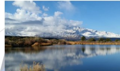
Roper Lake State Park

From hot springs to sand dunes to rock fields, Safford brings together many features that make Arizona famous in one place. Winter visitors are attracted to the climate and variety of natural resources, including hiking, swimming, fishing, hunting, bird watching, and much more.