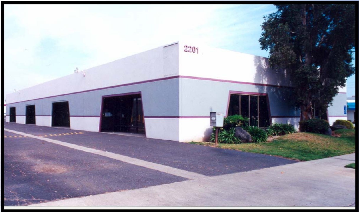
MULTI-TENANT INDUSTRIAL BUILDING 2201 S. STANDARD • SANTA ANA

± 1,200 - 6,000 SQ. FT. INDUSTRIAL UNITS