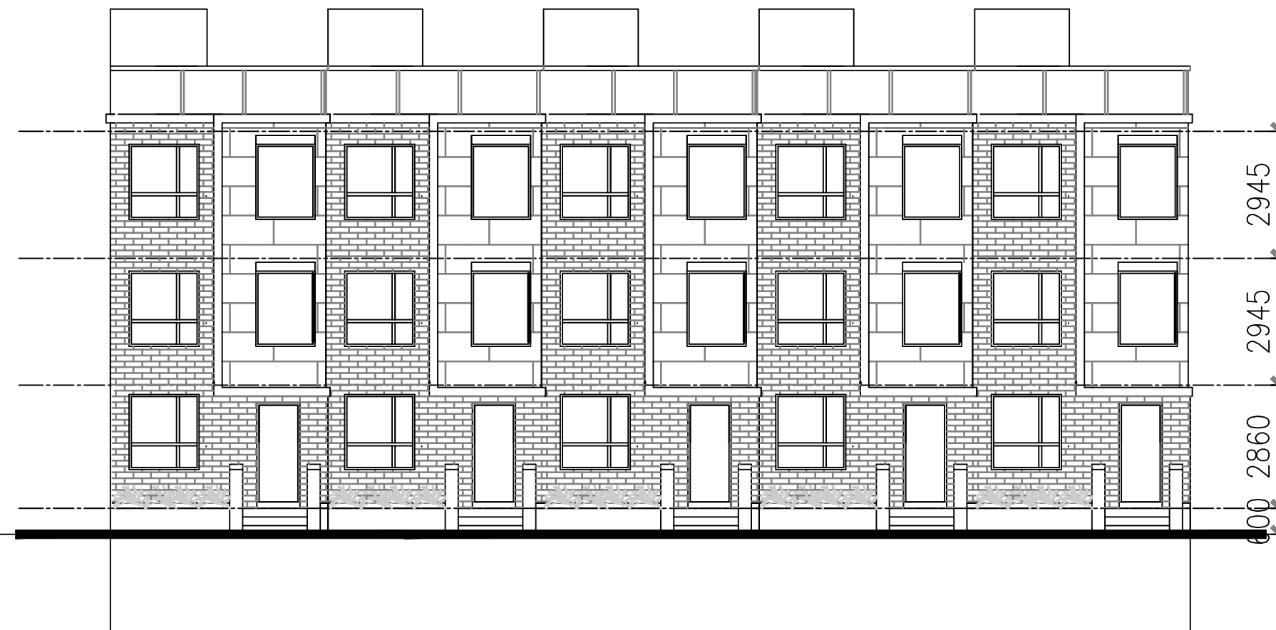
TOWNHOUSE BUILDING ELEVATION 1:125