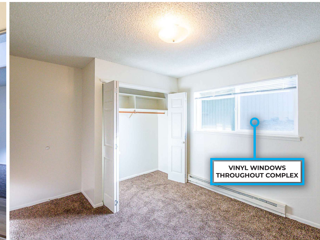
VINYL WINDOWS THROUGHOUT COMPLEX