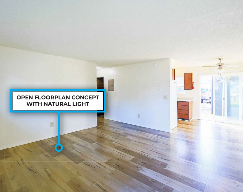
OPEN FLOORPLAN CONCEPT WITH NATURAL LIGHT