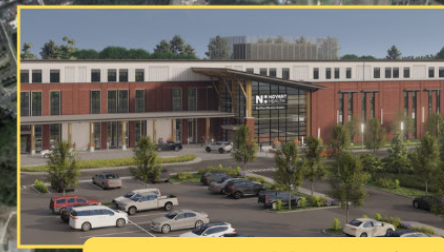
Novant Health Hospital In Permitting