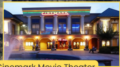
Cinemark Movie Theater