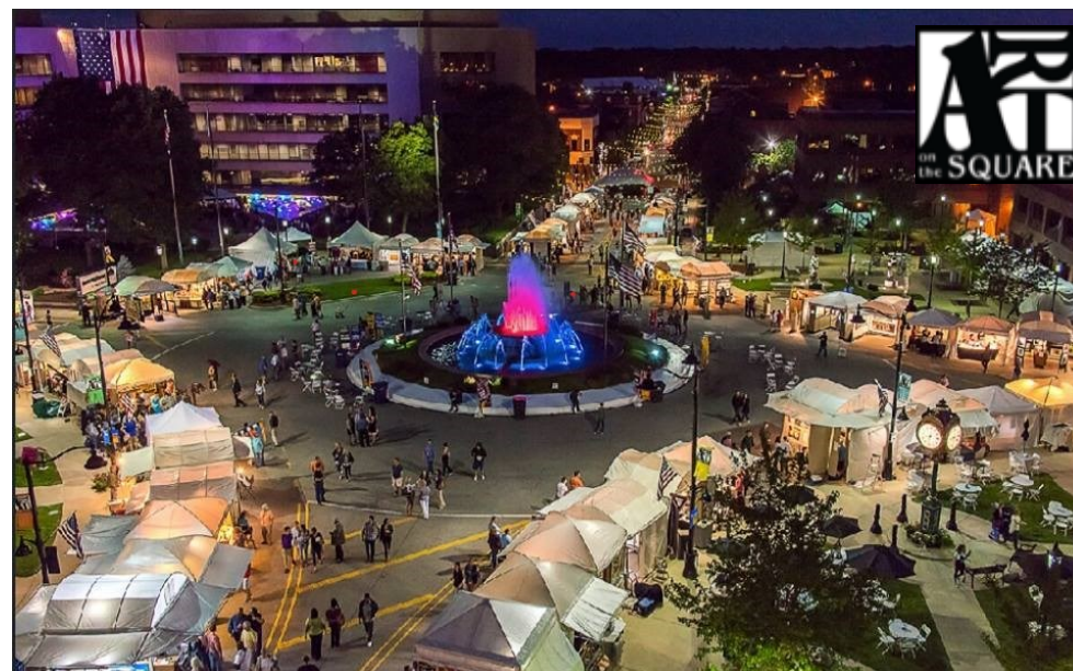
Art On The Square

Southwestern Illinois College has a large campus in Belleville. The City's top employers include Scott Air Force Base, Memorial Hospital and Southwestern Illinois College.