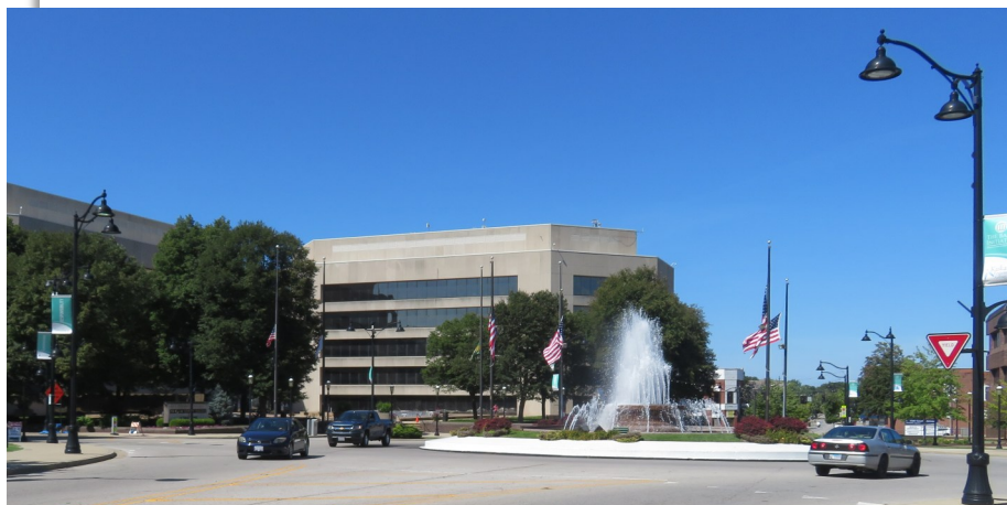
St. Clair County Court House on Belleville Public Square