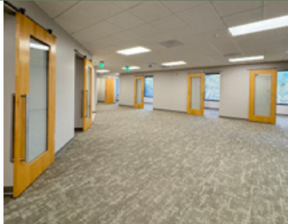
Suite 480 Virtual Tour