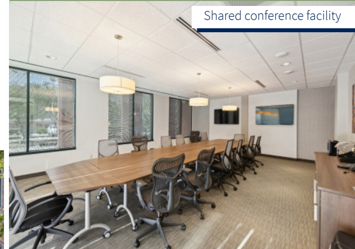
Shared conference facility