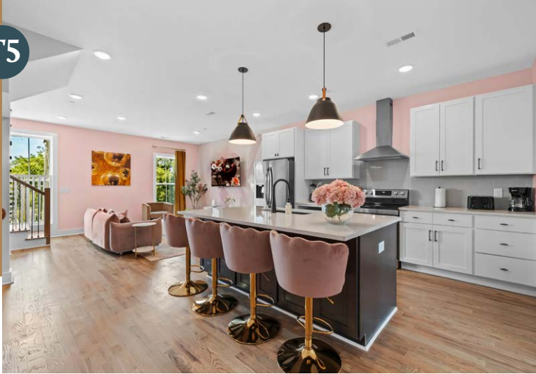
3BR Townhouse / Sleeps 10 / Rooftop