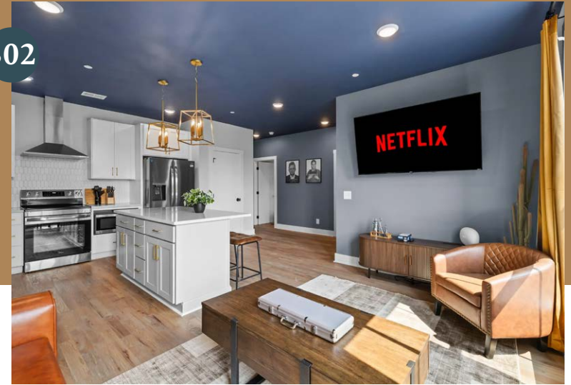
3BR Penthouse / Sleeps 12 / Rooftop