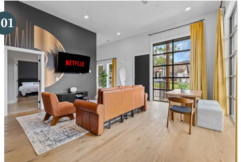
1BR Condo / Sleeps 6