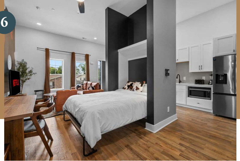
1BR Condo / Sleeps 6