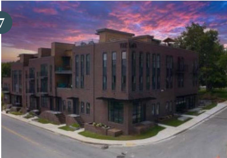
1BR Condo / Sleeps 4