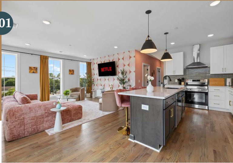
4BR Penthouse / Sleeps 14 / Rooftop