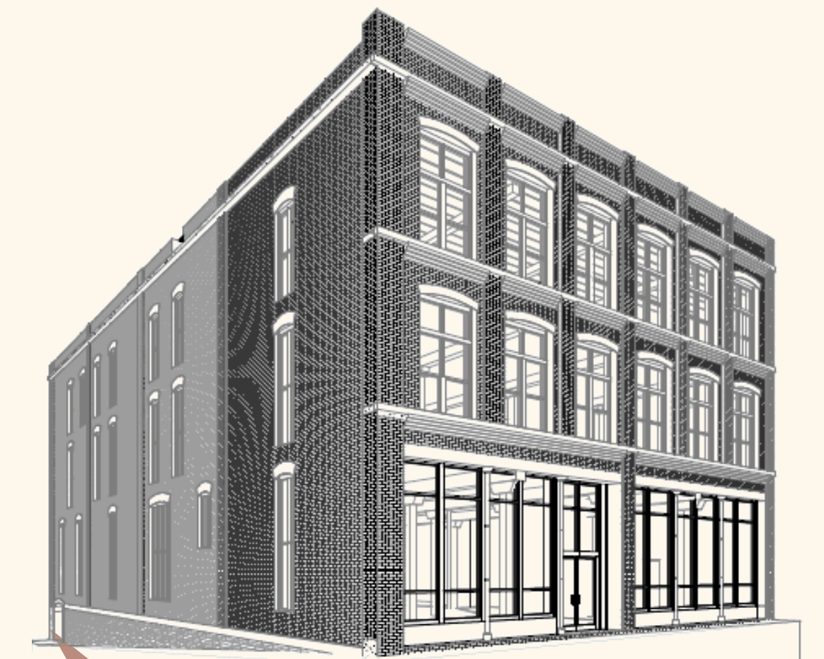
Entrance to Lower Level on Church Street