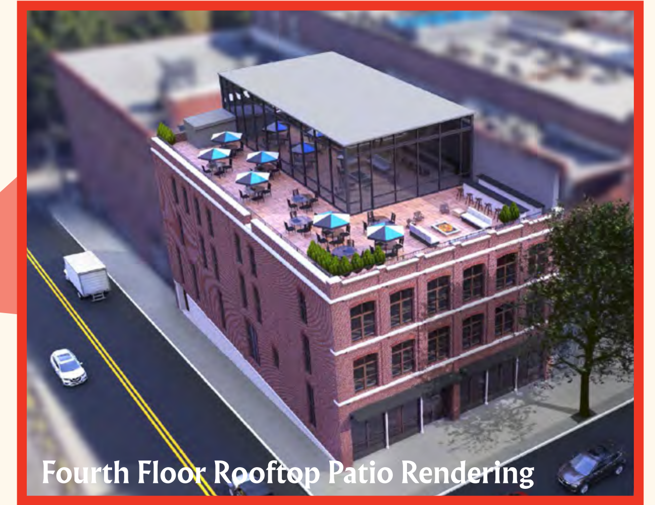
Fourth Floor Rooftop Patio Rendering