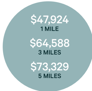
AVG. HOUSEHOLD INCOME