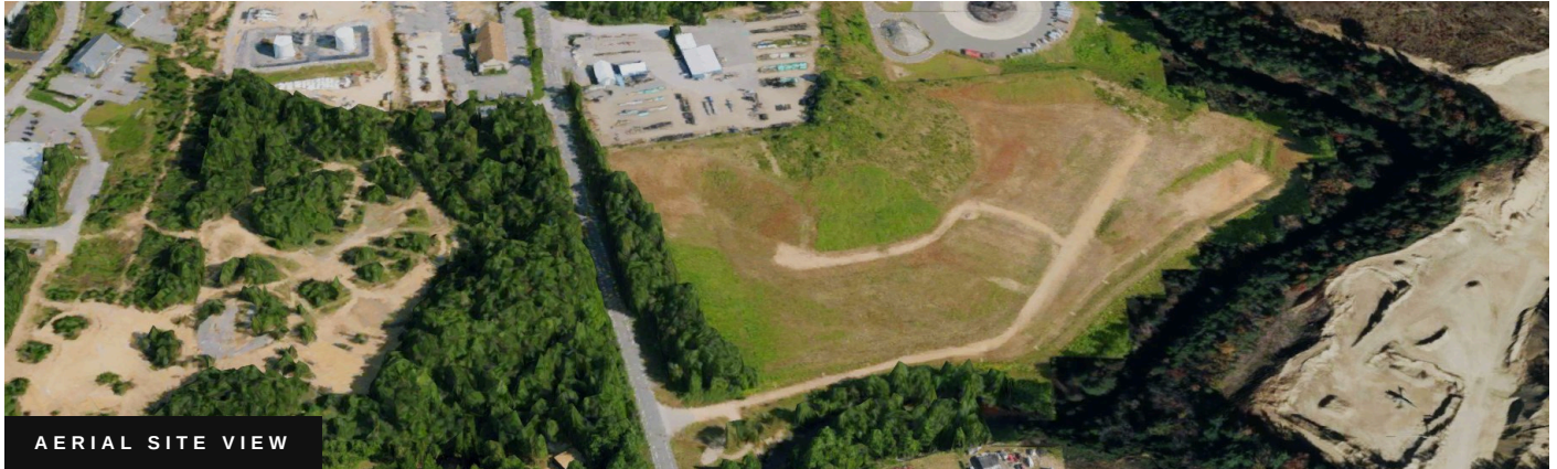
AERIAL SITE VIEW