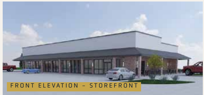
FRONT ELEVATION - STOREFRONT