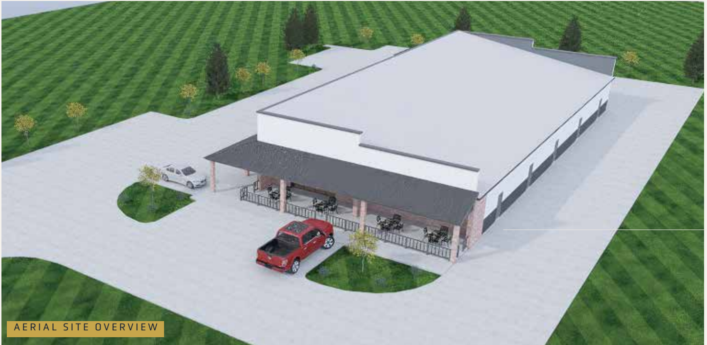
AERIAL SITE OVERVIEW

Class A neighborhood retail with downtown brick, covered walkways, and floor-to-ceiling storefront glass, designed to anchor the next phase of Caddo Mills growth.