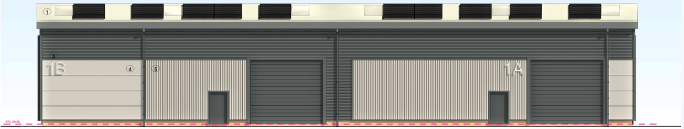
proposed west elevation 1:100