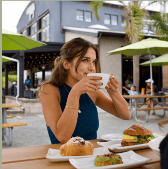
LOFTY COFFEE CO.