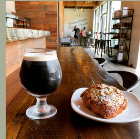
BAREFOOT COFFEE ROASTERS