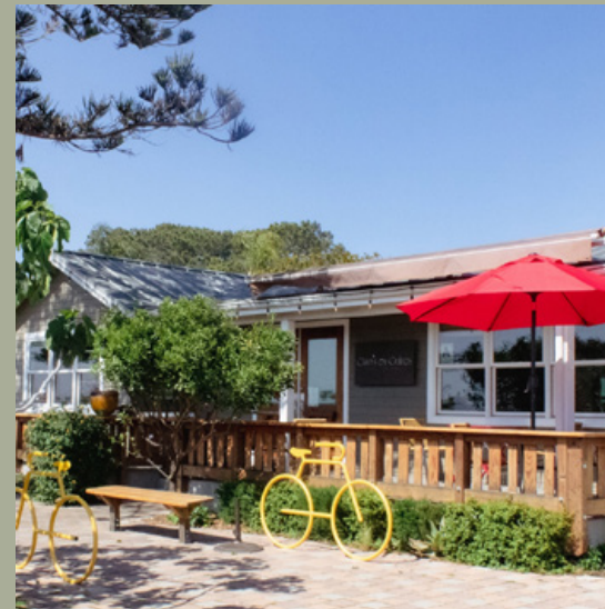
CLAIRE'S ON CEDROS