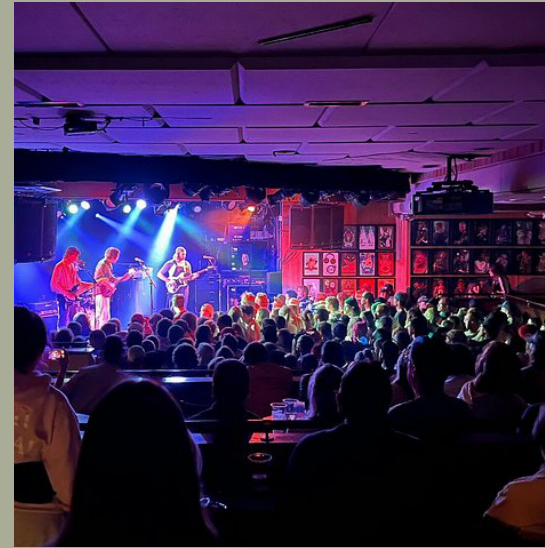
BELLY UP TAVERN