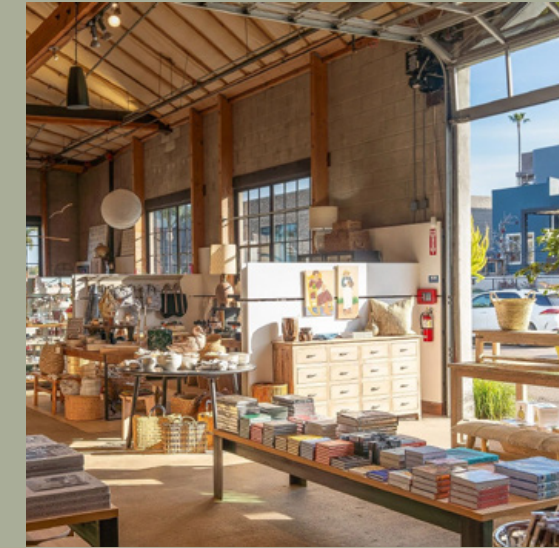
SOLO ON CEDROS