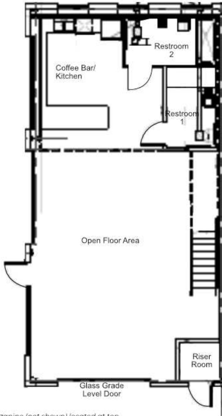
Clubhouse - Floor Plan

Mezzanine (not shown) located at top Dimensions - 20'x24'