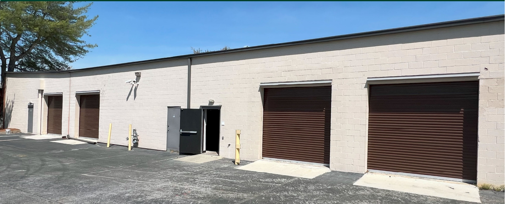
Building 300 | 13,387 SF Available