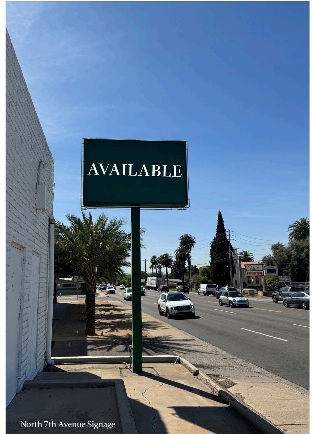
North 7th Avenue Signage