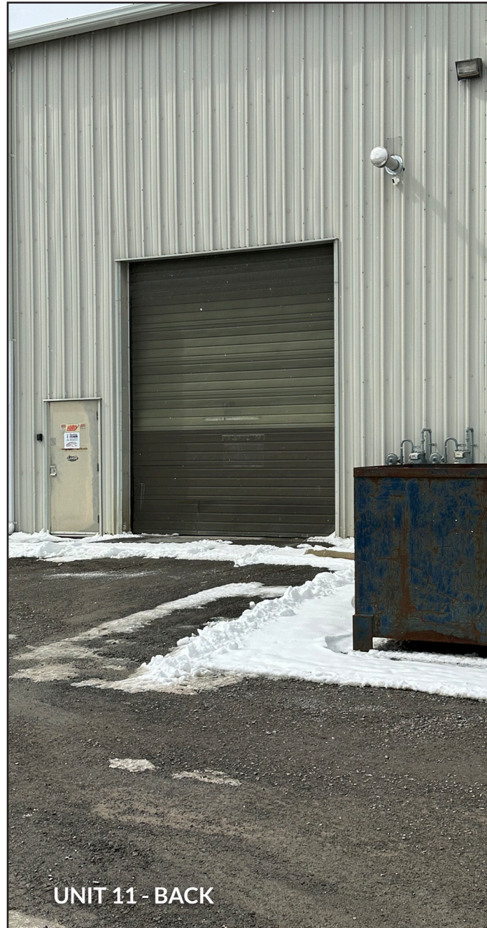
UNIT 11 - BACK