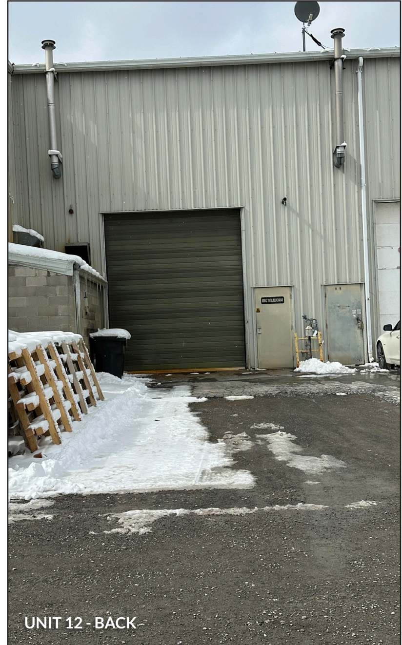
UNIT 12 - BACK