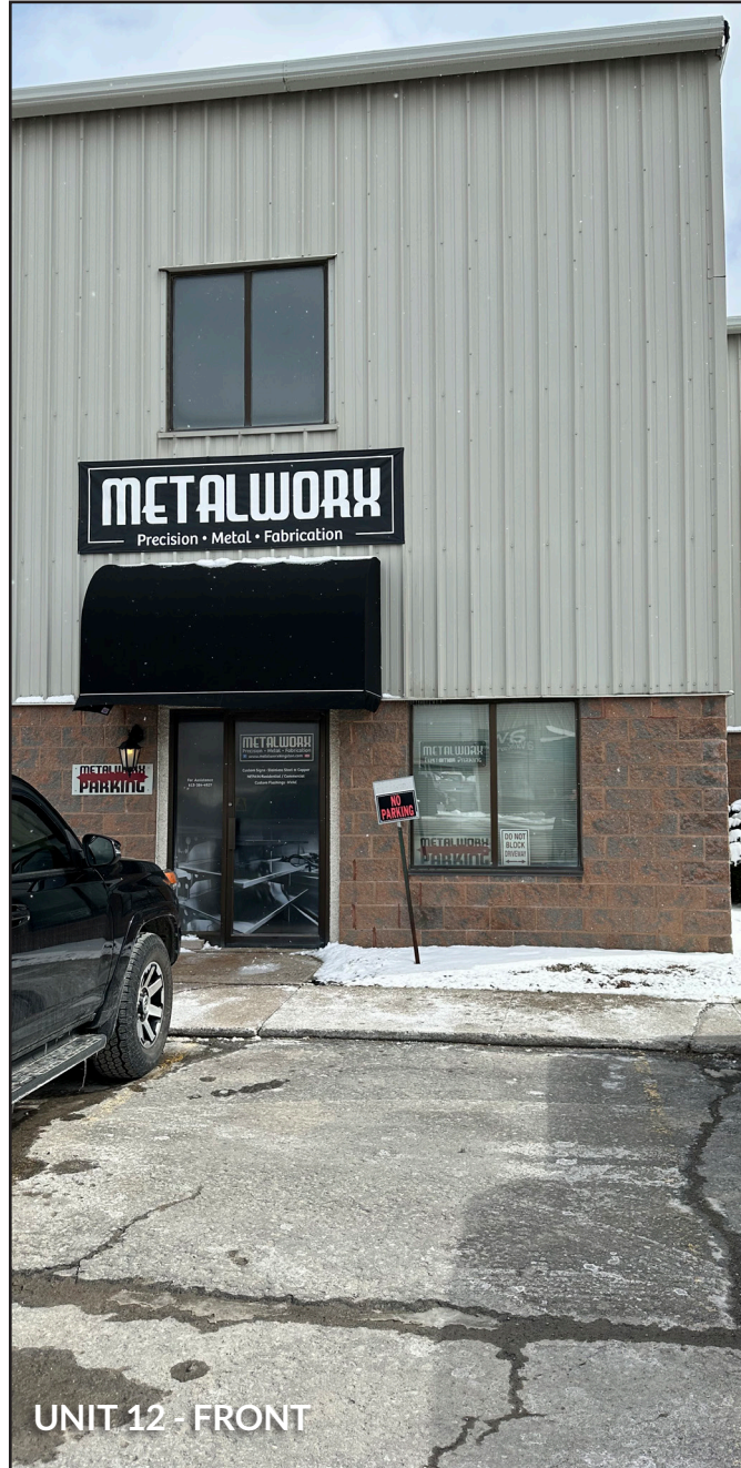
UNIT 12 - FRONT