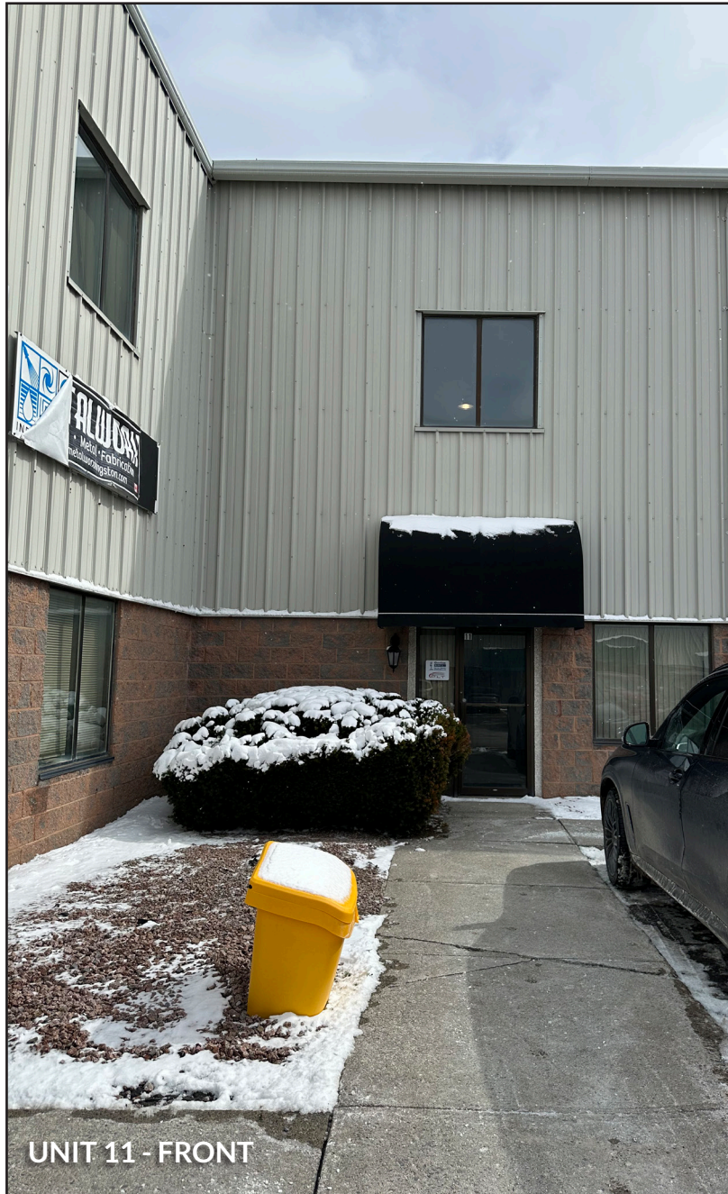
UNIT 11 - FRONT