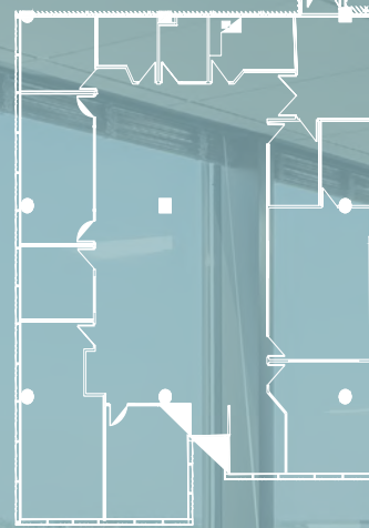
Suite 625: 4,771 SF