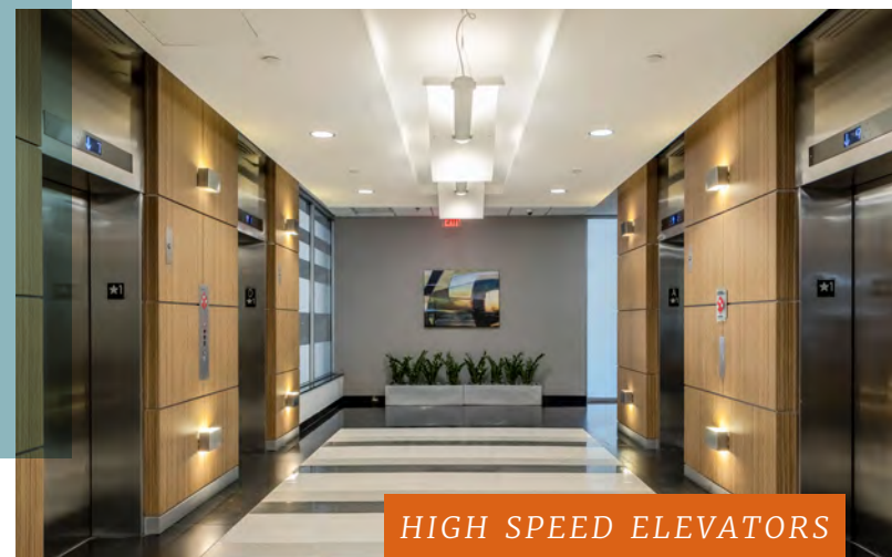
HIGH SPEED ELEVATORS