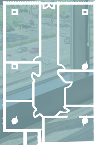
Suite 1000: 3,510 SF