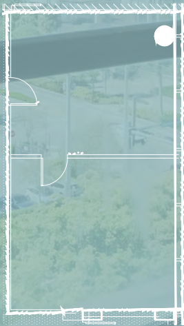
Suite 718: 563 SF