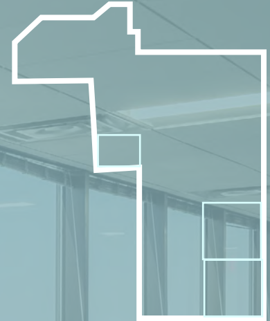
Suite 710: 1,758 SF