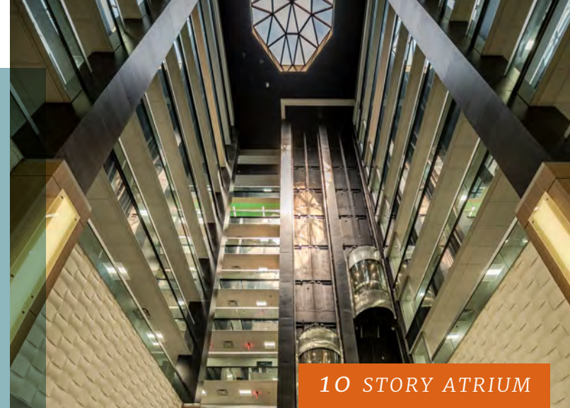
10 STORY ATRIUM