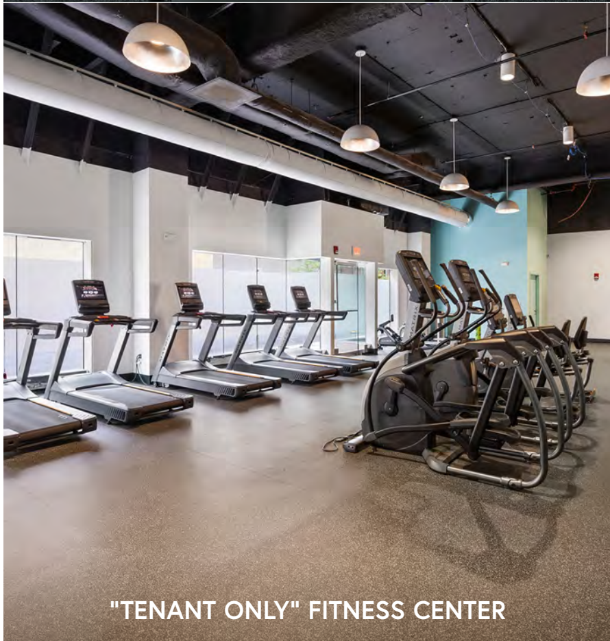
"TENANT ONLY" FITNESS CENTER