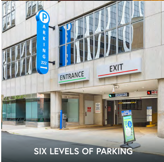
SIX LEVELS OF PARKING