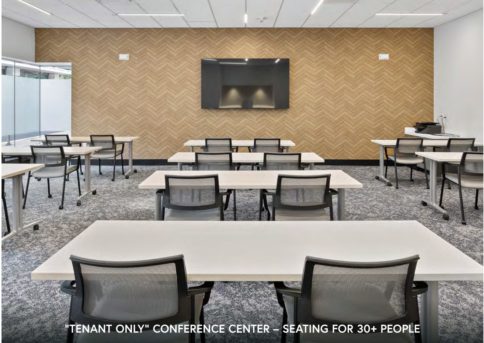
"TENANT ONLY" CONFERENCE CENTER – SEATING FOR 30+ PEOPLE