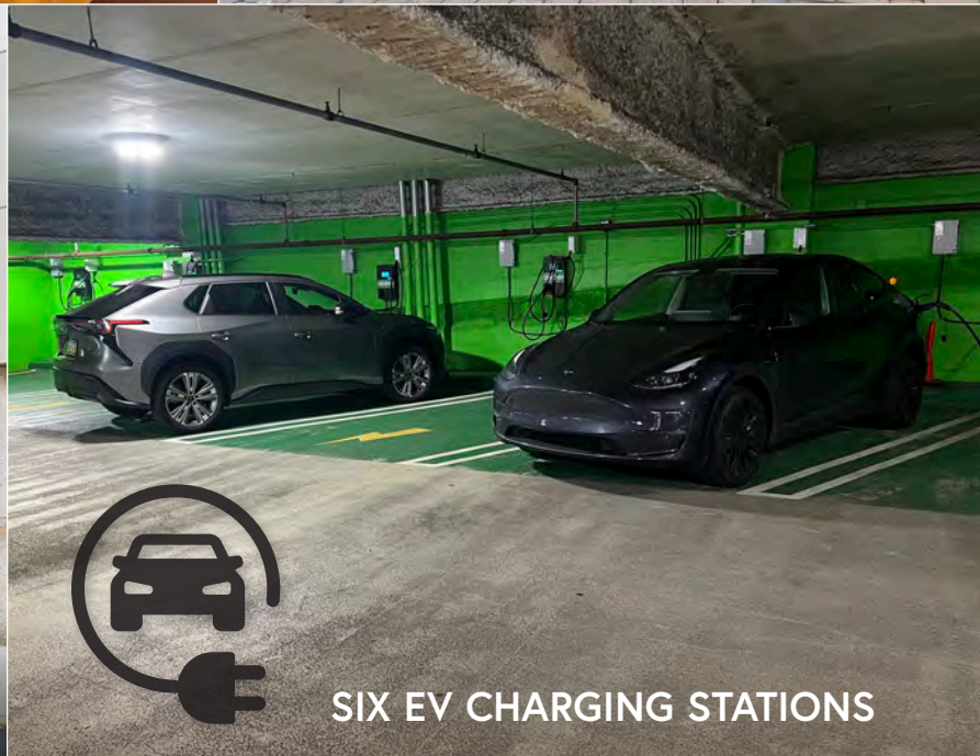
SIX EV CHARGING STATIONS