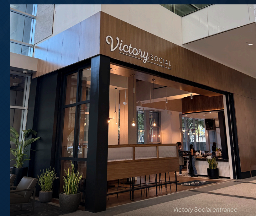
Victory Social entrance