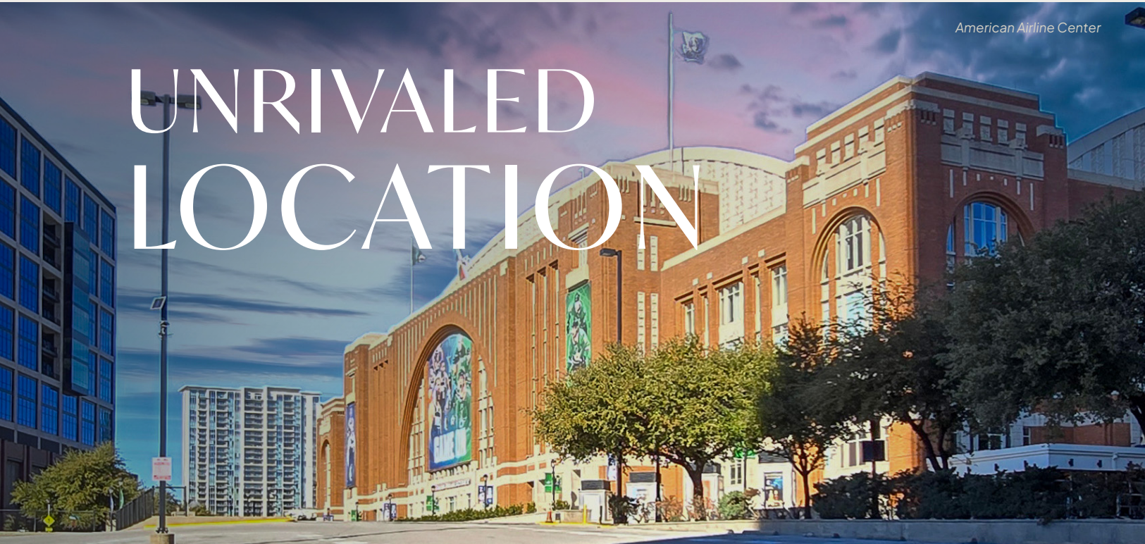
American Airline Center