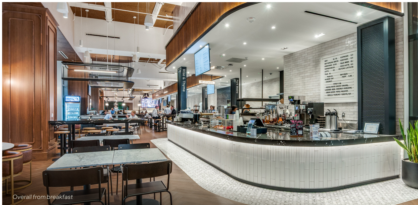
Overall from breakfast