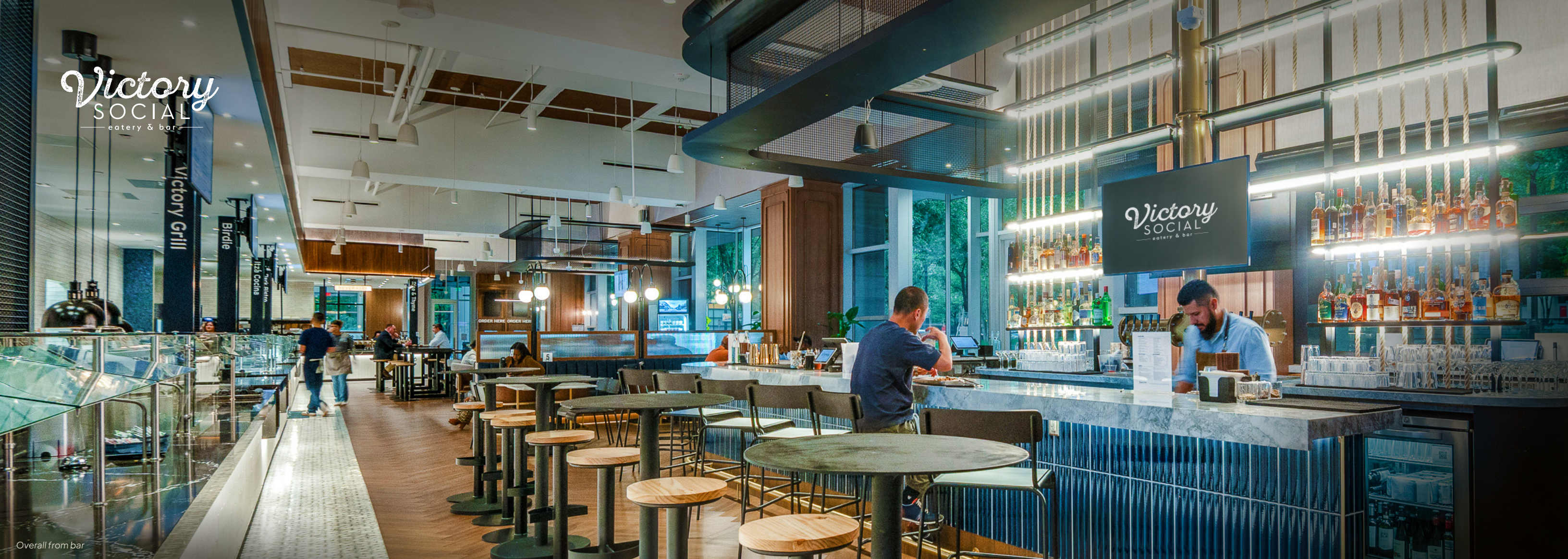
Overall from bar