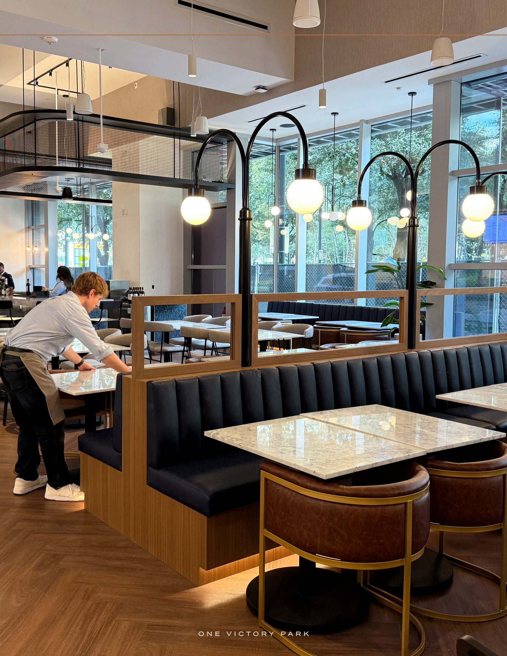
ONE VICTORY PARK