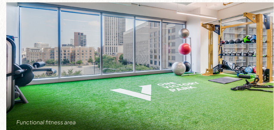
Functional fitness area