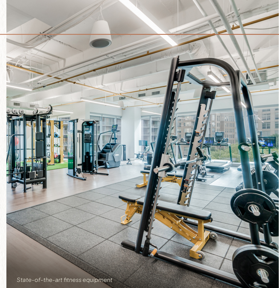
State-of-the-art fitness equipment