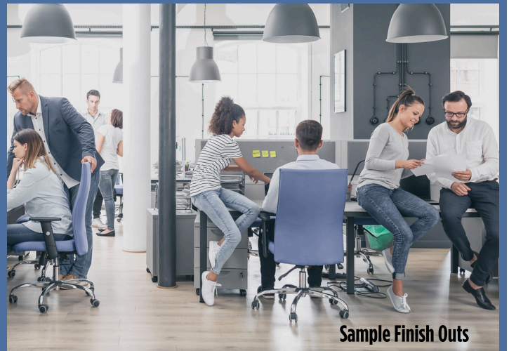
Sample Finish Outs