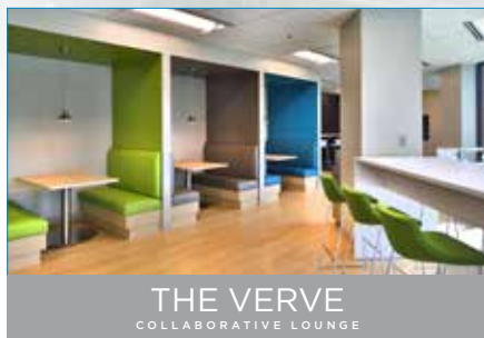
THE VERVE COLLABORATIVE LOUNGE