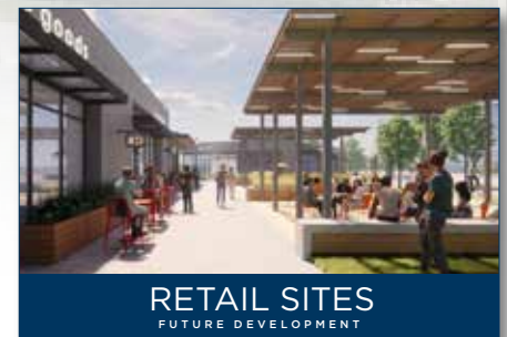
RETAIL SITES FUTURE DEVELOPMENT