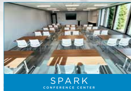
SPARK CONFERENCE CENTER