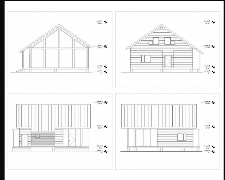
CABIN ELEVATION - ~823 FT 2