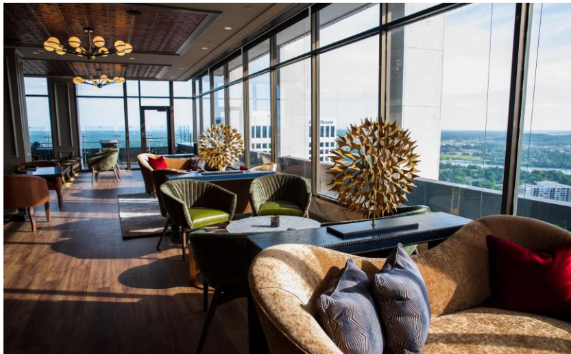
The Summit Club – Arvest Tower