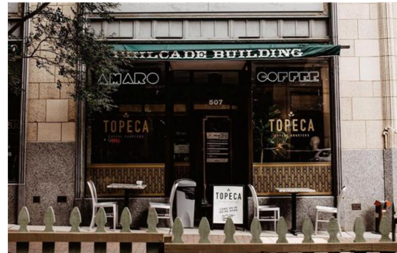
Topeca Coffee – Philcade Building