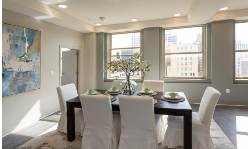
111 Lofts Building – Residential