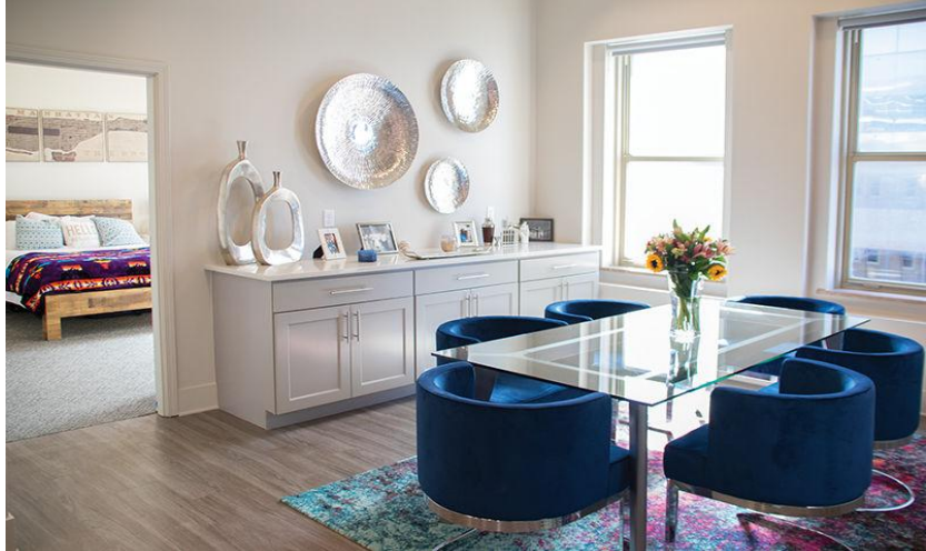
Art Deco Lofts & Apartments Building – Residential