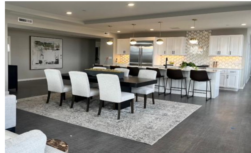
Arco Building – Residential