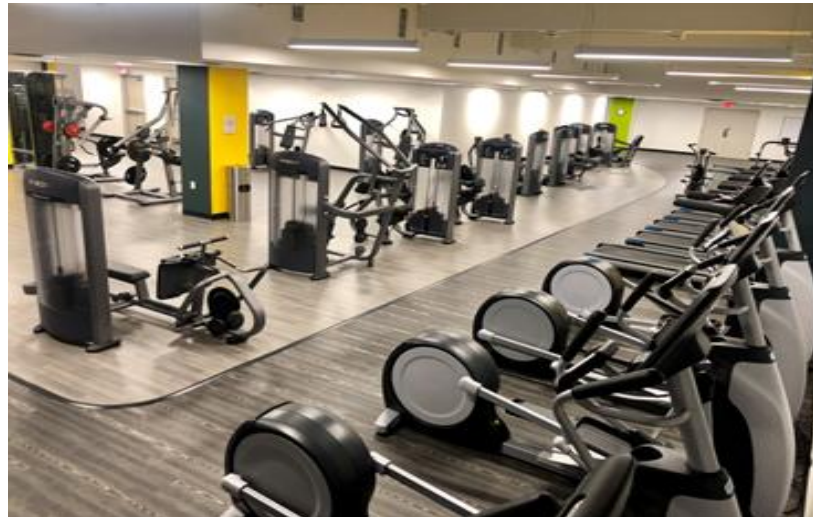
First Place Tower -Fitness Center