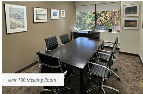
Unit 100 Meeting Room