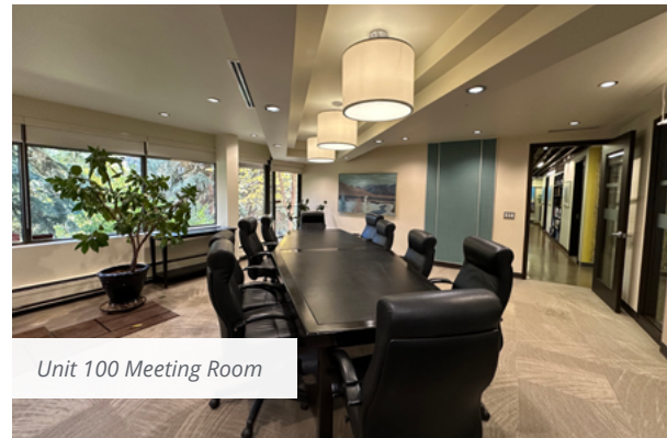
Unit 100 Meeting Room