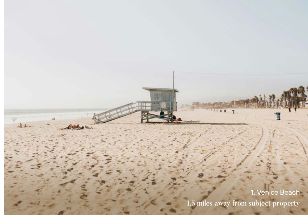
1. Venice Beach 1.5 miles away from subject property

Venice Beach is an iconic landmark that stretches along the Pacific Ocean. It offers stunning views of the coast and the Santa Monica Mountains. Home to the Venice Beach pier it hosts a variety of shops, restaurants, and entertainment options, making it a popular destination for both locals and tourists. Visitors can enjoy delicious food at one of the many beachfront restaurants, shop for souvenirs or simply relax and take in the breathtaking scenery. The pier features a fishing area where visitors can try their luck at catching some local fish, the beach walk is home to the famed Gym and Skate Park.