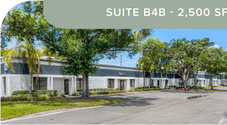
SUITE B4B - 2,500 SF

12816 DUPONT CIRCLE, SUITE B4B | TAMPA, FL 33626