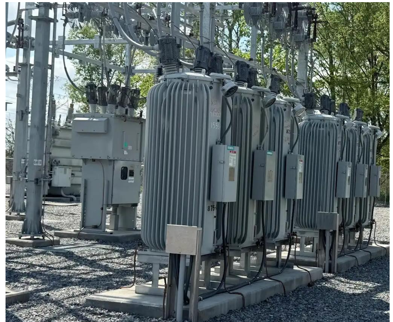
GA Power "East Augusta" yard at 1581 Columbia Nitrogen Drive behind Praxair