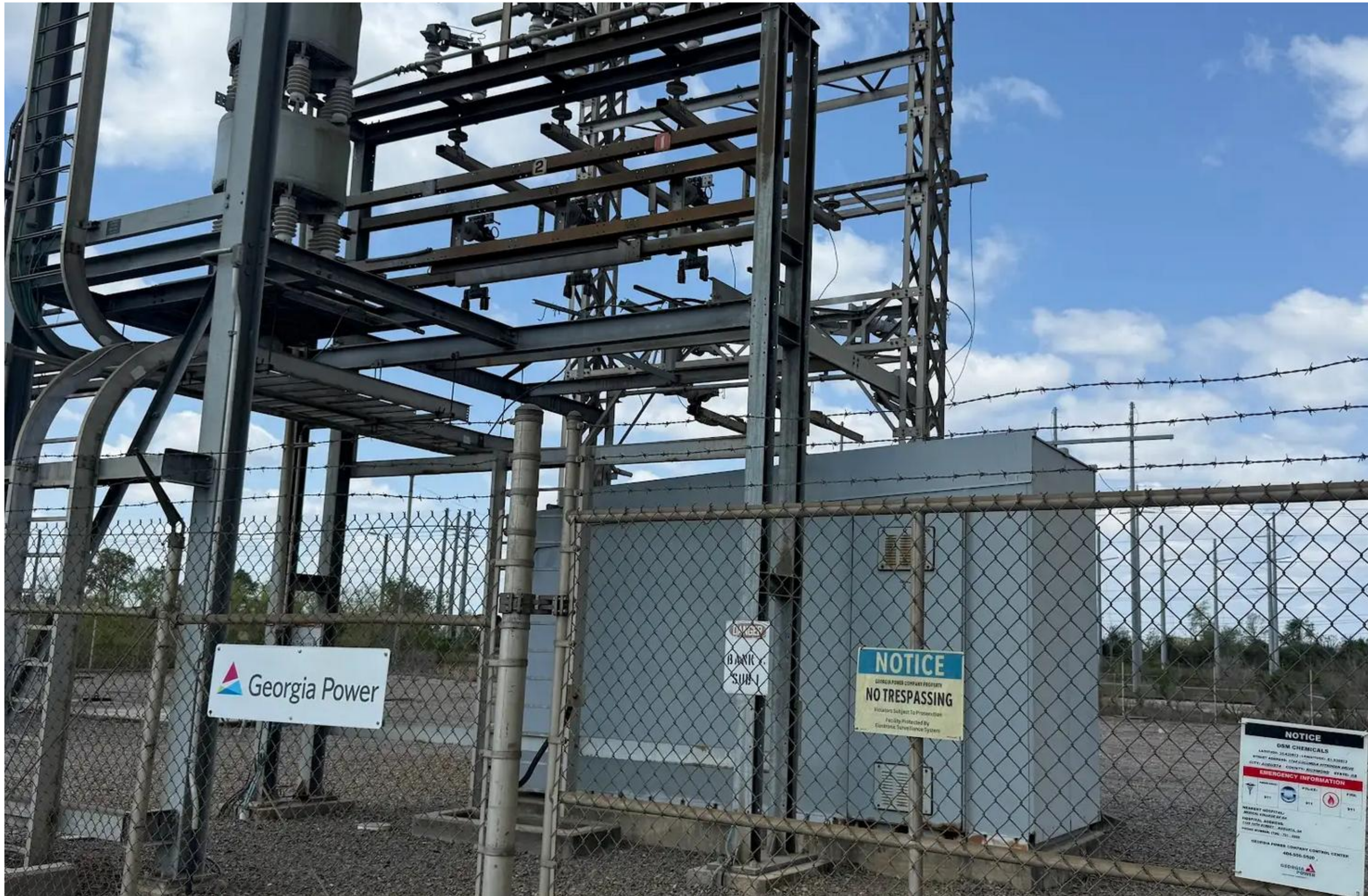
GA Power "DSM Chemicals" yard at 1754 Columbia Nitrogen Drive