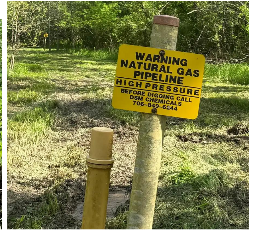
Southern Natural Gas Company serving the Augusta GA site.