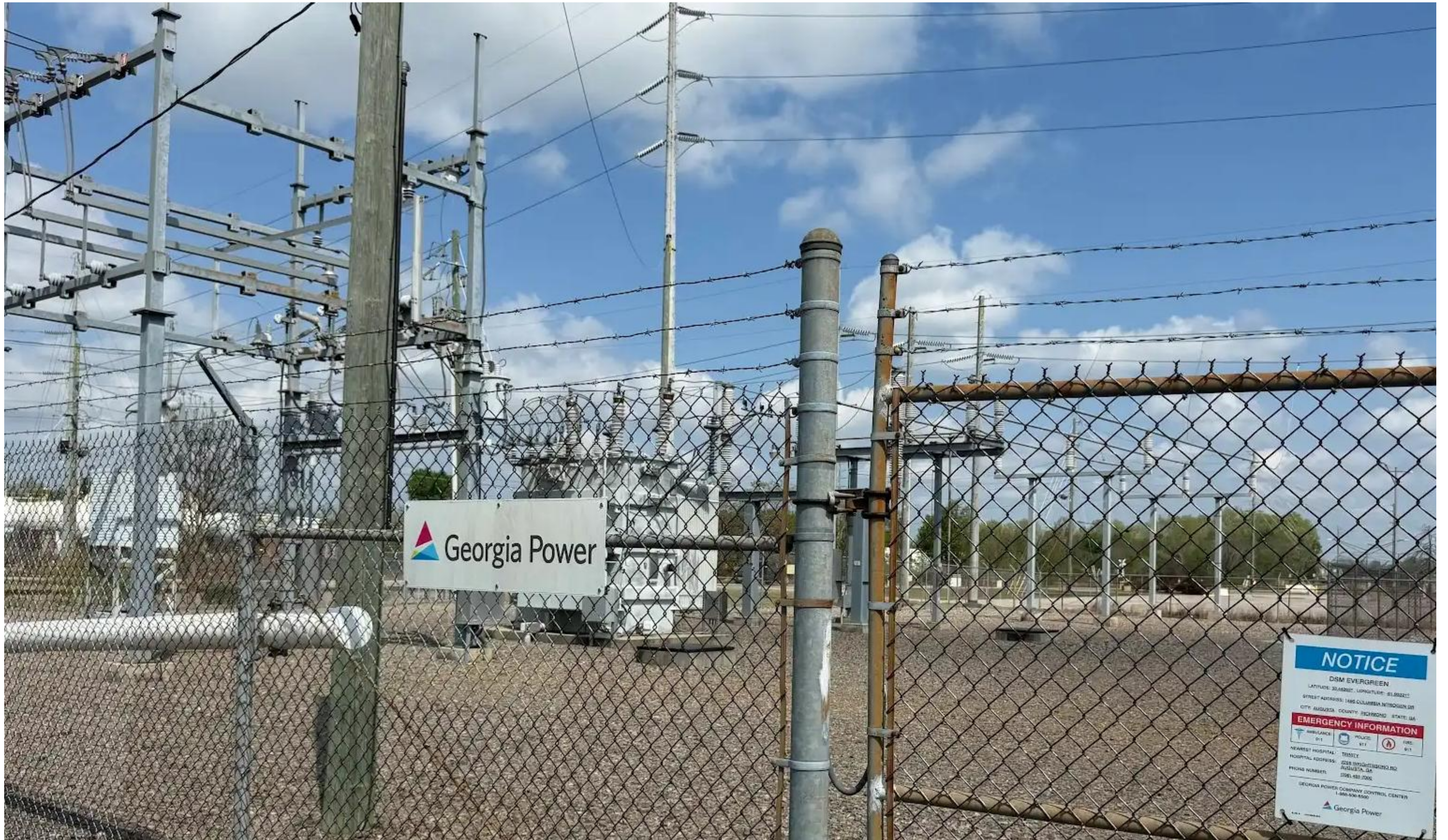
GA Power "DSM Evergreen" yard at 1480 Columbia Nitrogen Drive