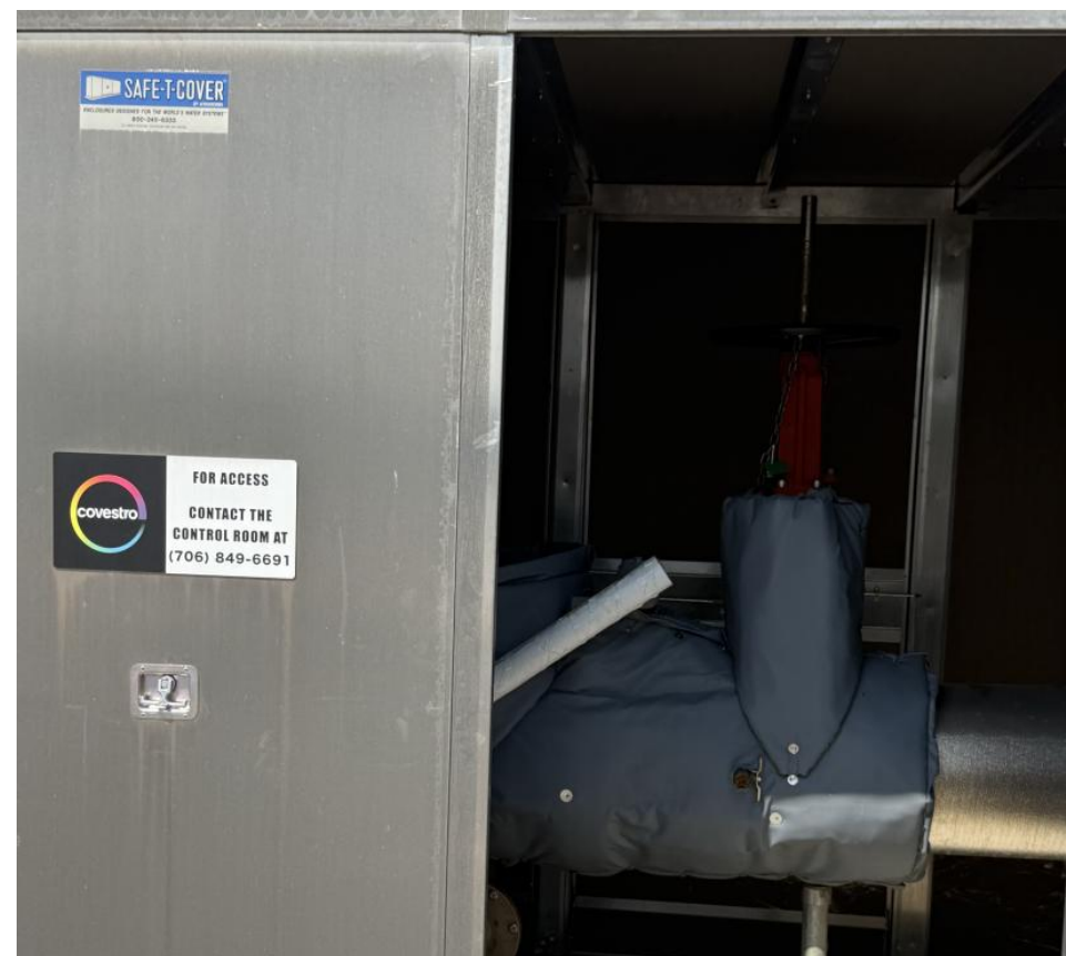
12" Fire Suppression System with Diesel backup - installed in 2022 for $5 million