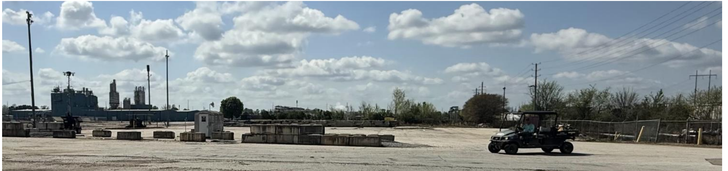
Building recently vacated by tenant and may soon be demolished by Owner