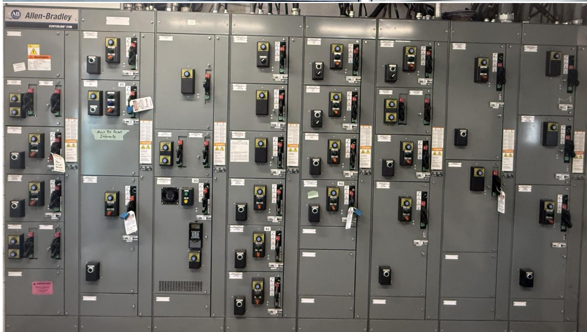
“Allen-Bradley” electric control panel