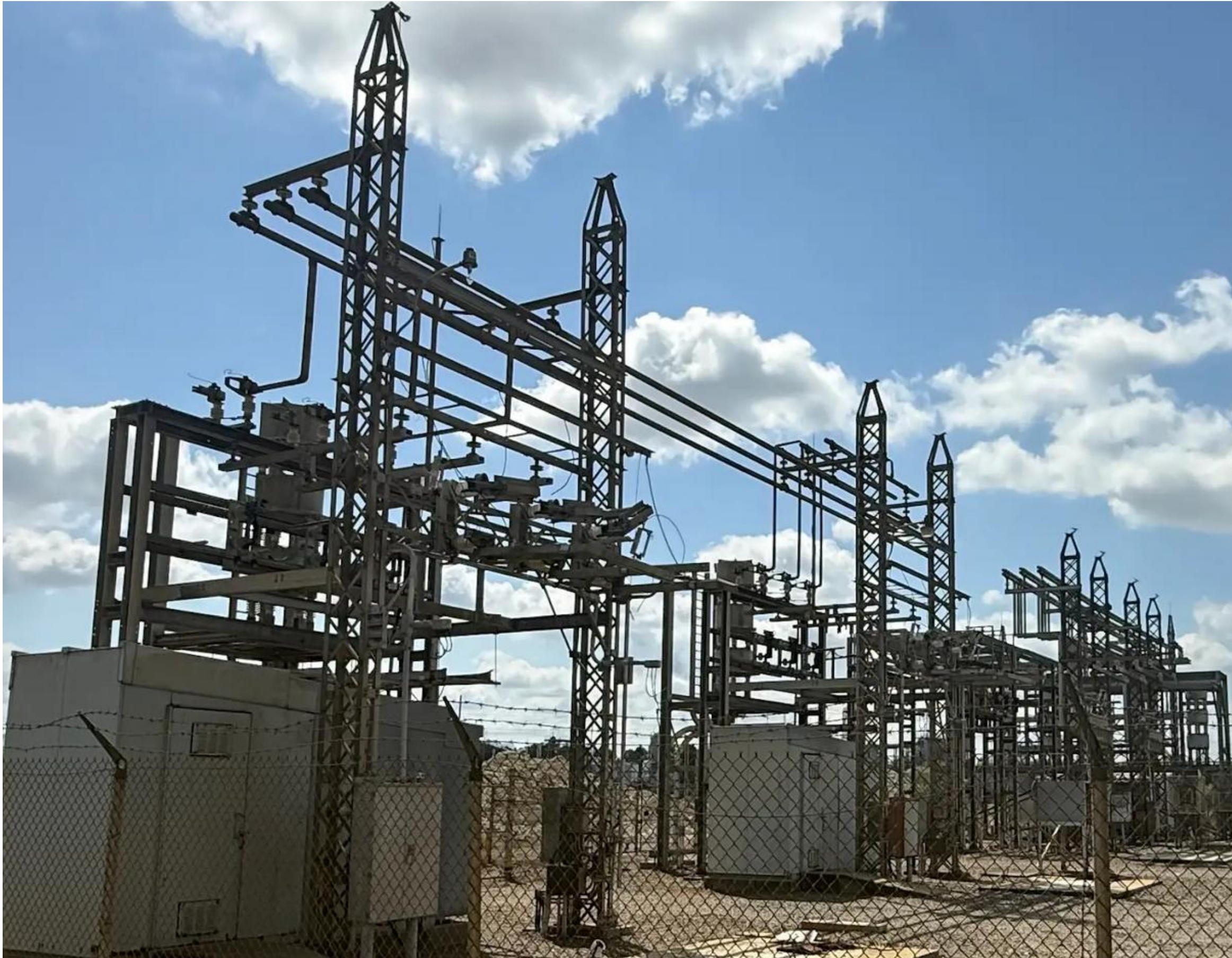
GA Power “unknown named” yard that is now not in service