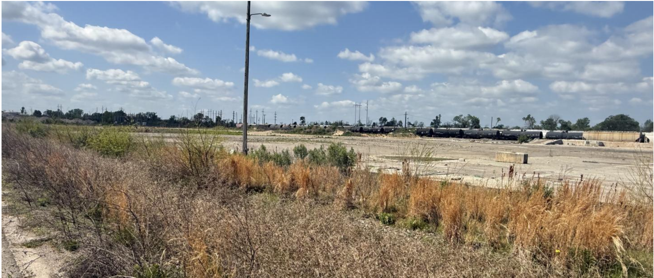
Site photos showing vacant land where Owner recently demolished former buildings