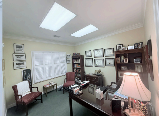
Office 1 Right-side