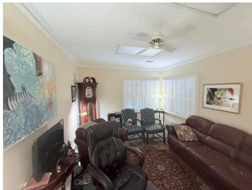
Office 1 Left-side