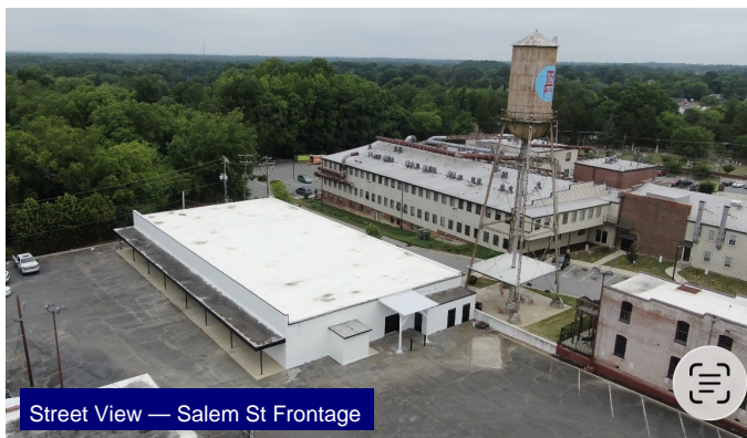
Street View — Salem St Frontage