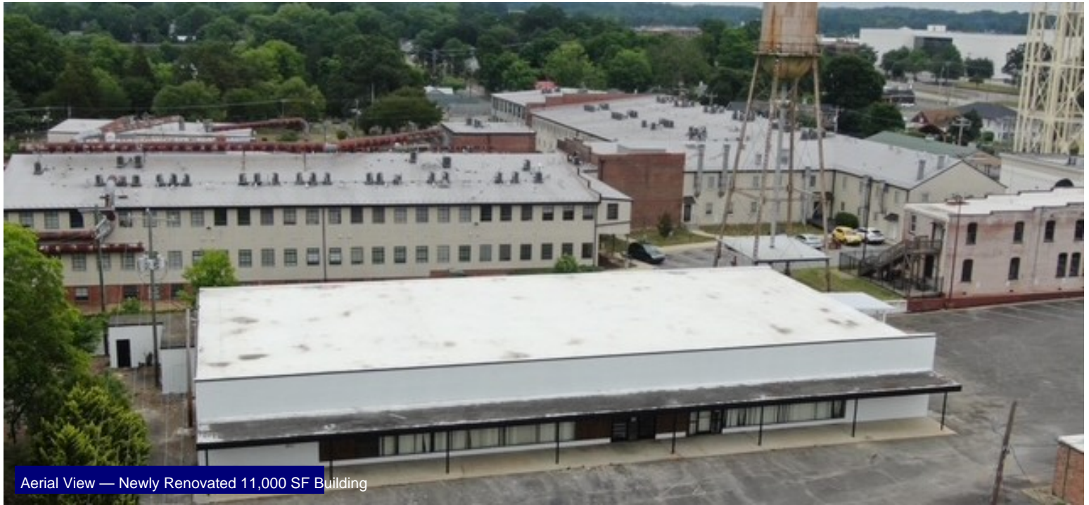
Aerial View — Newly Renovated 11,000 SF Building