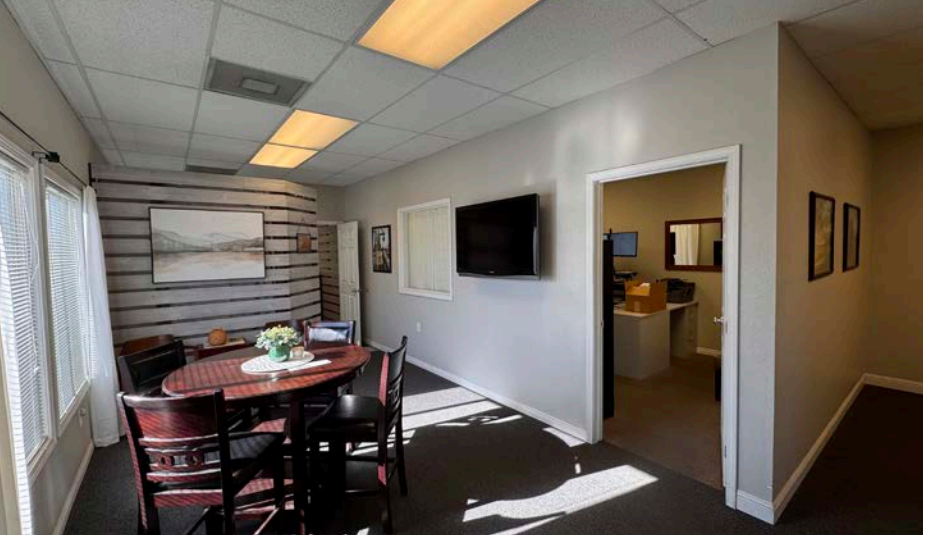
900 SF OFFICE