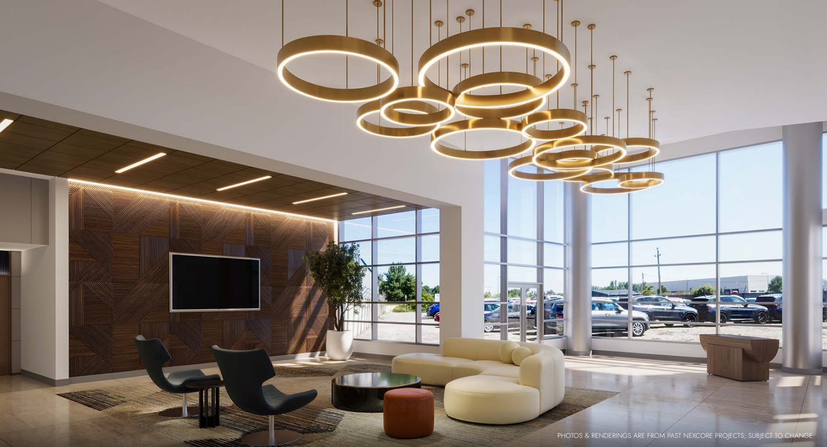
PHOTOS & RENDERINGS ARE FROM PAST NEXCORE PROJECTS, SUBJECT TO CHANGE.