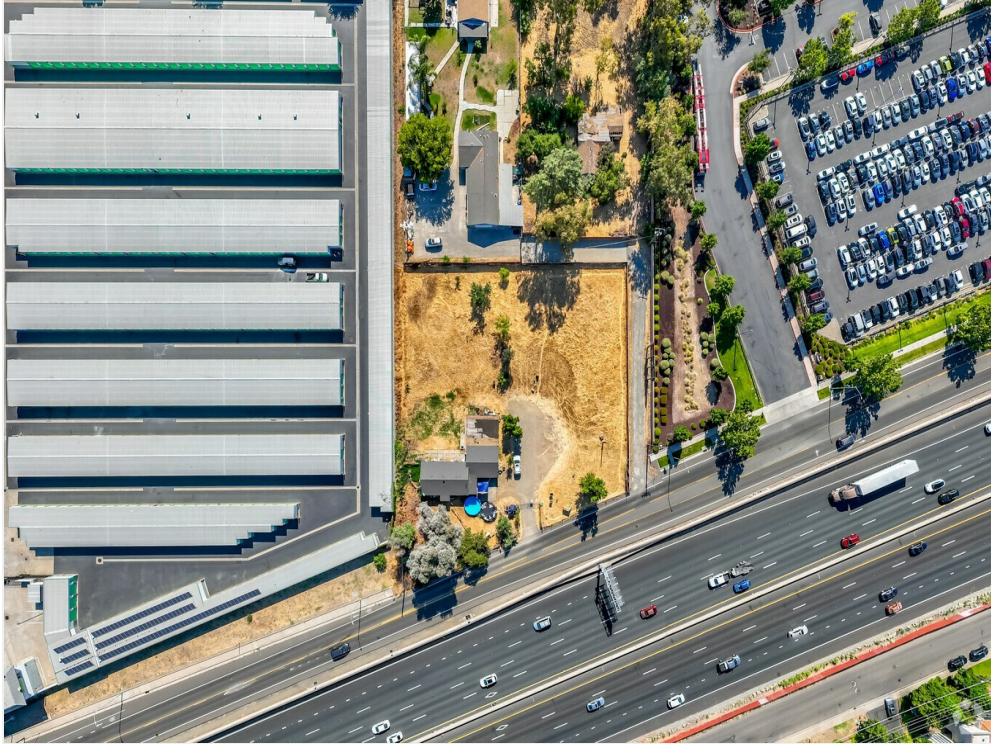
90° Look Down