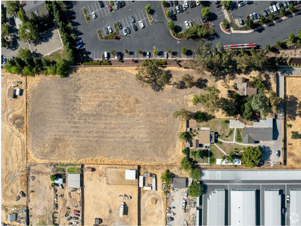
90° Look Down