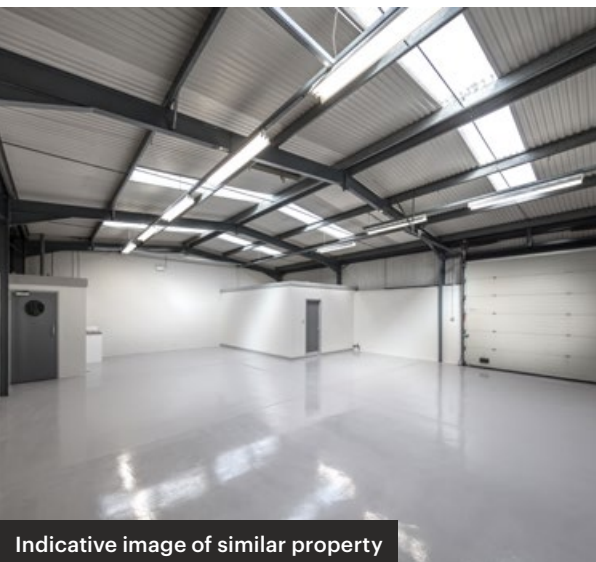
Indicative image of similar property