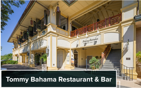
Tommy Bahama Restaurant & Bar