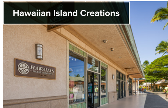
Hawaiian Island Creations