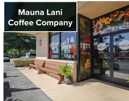
Mauna Lani Coffee Company