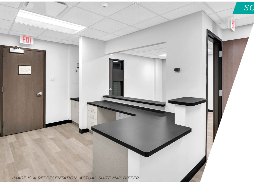
IMAGE IS A REPRESENTATION. ACTUAL SUITE MAY DIFFER.

Our SPEC suites combine convenience and quality in one perfect package. With sleek, modern finishes already in place, these suites are designed to be fully operational as soon as you move in. Skip the hassle and delays of construction and permitting— just move in and start seeing patients!