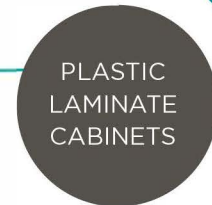
PLASTIC LAMINATE CABINETS