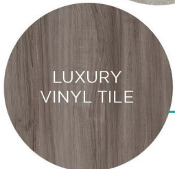
LUXURY VINYL TILE