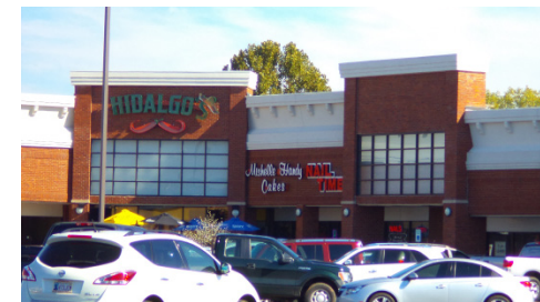
Planet Fitness and Hidalgo's generate daytime and nighttime traffic.

Call Grant Stewart today at 405.842.0100