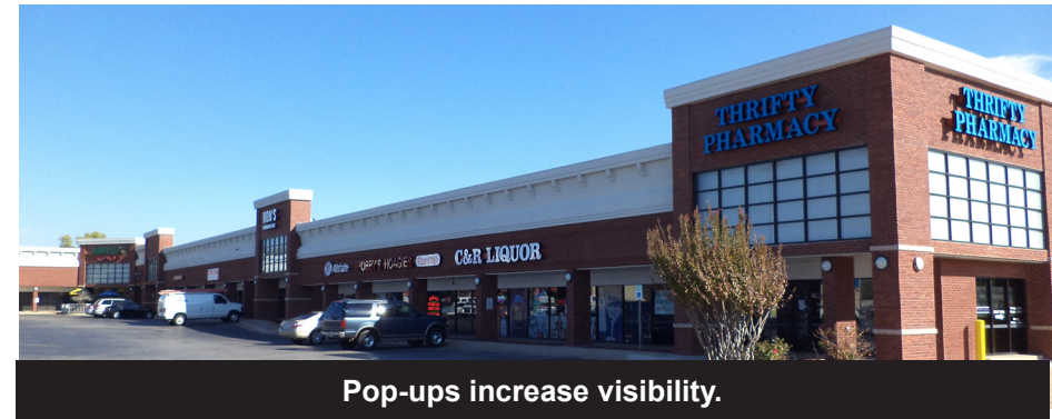
Pop-ups increase visibility.