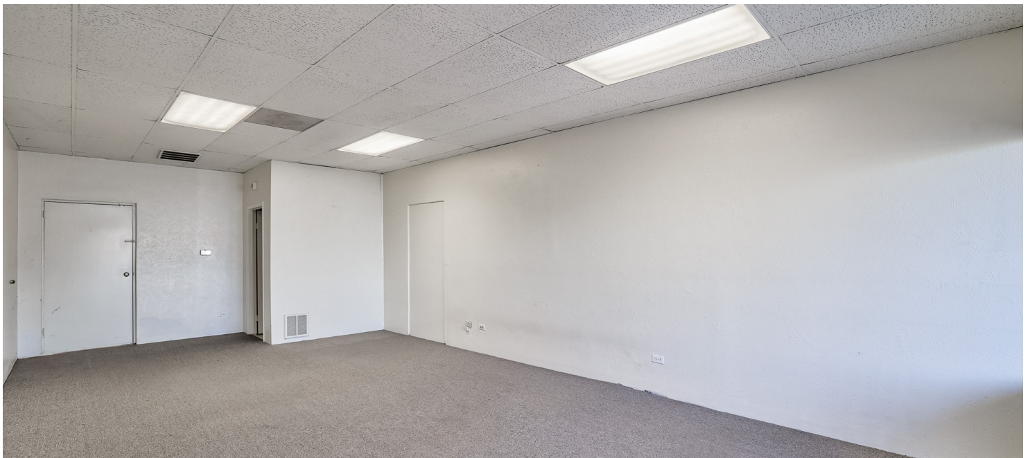
# 513 Front