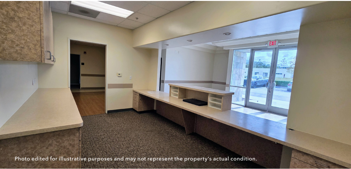
Photo edited for illustrative purposes and may not represent the property's actual condition.